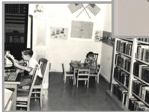
Children in the library