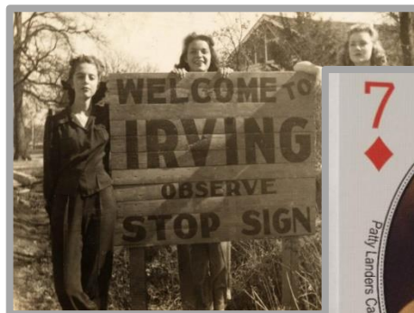
Welcome to Irving

www.northtexasgivingday.org/irvingheritagesociety Your support is greatly appreciated as we create virtual tours of the Heritage House and Mary's Playhouse for our community.